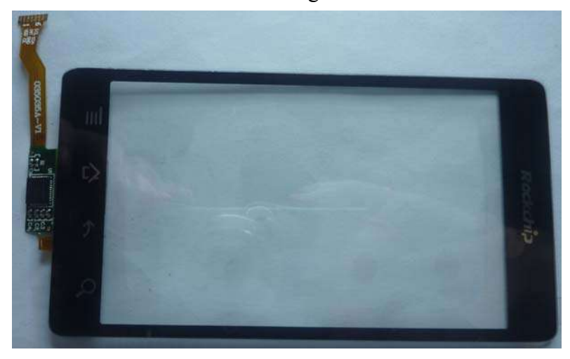
5. 5 Cosmetic inspection criteria