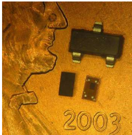
Fig.3 Top and bottom of a WL-CSP package sitting on the face of a U.S. penny. In the top-right, a SOT23 package is shown for comparison. Penny diameter: 19.05 mm (0.75 in).

A CSP is a very small electronic device package: one that similar in size to the integrated circuit — the “chip” — that it contains.