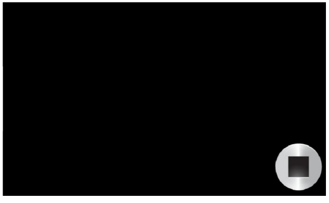
Bright dot checking