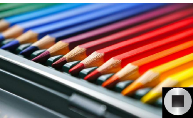
RGB color checking